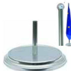
DIPLO silver 1 pole