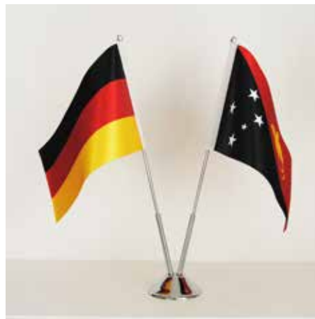
TWIN TABLE FLAG DOUBLESIDED

Pole 30 cm silver pole and base Flag: 22,5 x 15 cm