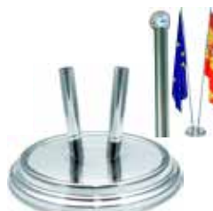
DIPLO silver 2 poles