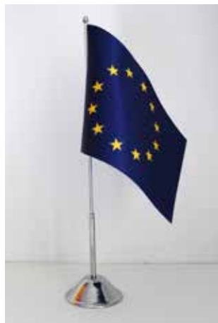
TABLE FLAG DOUBLESIDED

Pole 42 cm silver pole and base Flag: 25 x 15 cm