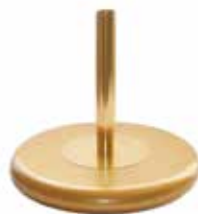
Standard gold 1 pole