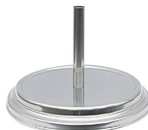
DIPLO silver 1 pole