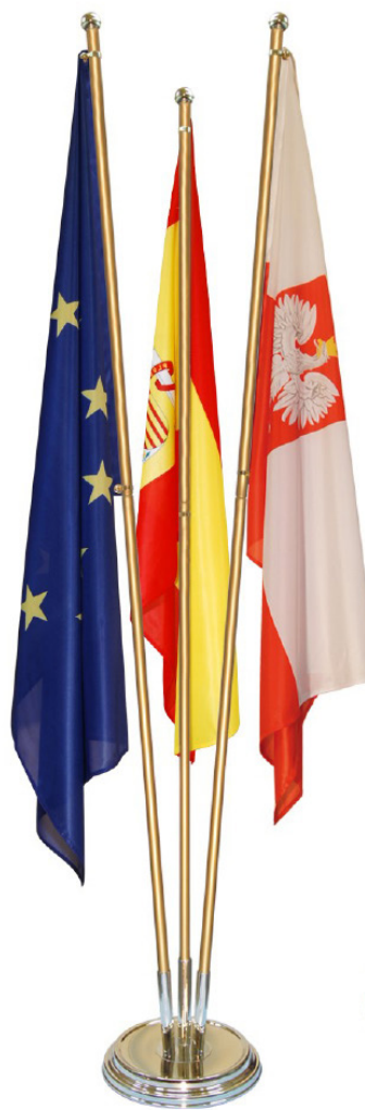
DIPLO gold 3 poles