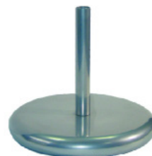
Standard silver 1 pole