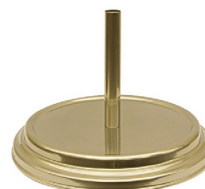
DIPLO gold 1 pole