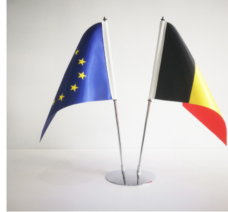
TWIN TABLE FLAG DOUBLESIDED

Pole 30 cm silver pole and base Flag: 10 x 15 cm