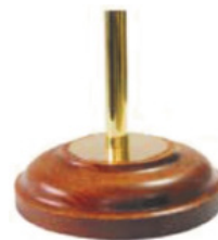
Wood 1 pole