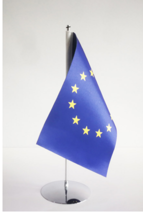
TABLE FLAG DOUBLESIDED

Pole 42 cm silver pole and base Flag: 25 x 15 cm