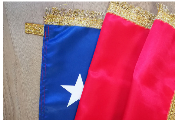
Double sided satin flag with gold fringes