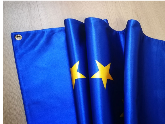
Double sided satin flag with eyelets