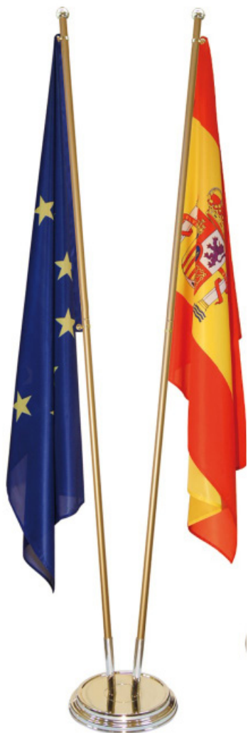
DIPLO gold 2 poles