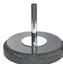
Marmer 1 pole