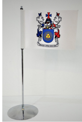
TABLE FLAG STANDUP

Pole 30 cm silver pole and base Flag: 22,5 x 15 cm