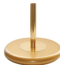
Standard gold 1 pole